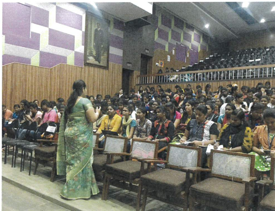
STUDENTS LISTENING INTENTLY